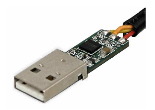
Figure 2 - Inside the USB 'A' connector on the TTL-232R.