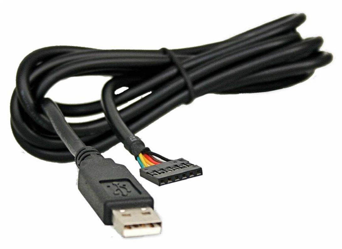
Figure 1 - The TTL-232R USB to TTL Serial Converter Cable.